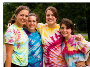
Tye-dying & Kickball