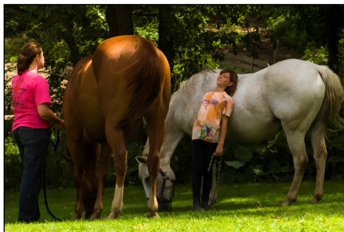
Being with horses is a little piece of heaven.

Some were wallflowers. Others were struggling with the stresses of school or family. Most found themselves