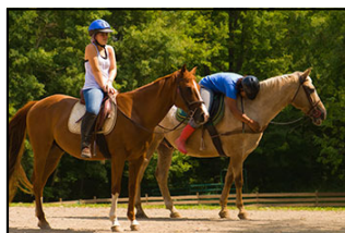
Loving your horse!