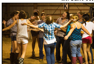
Karaoke & Barn Dances